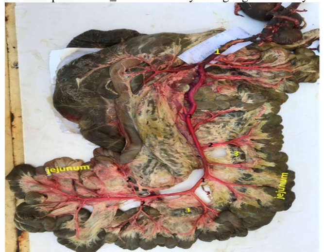
Fig. 9: Branching of cranial mesenteric artery in supplying jejunum with blood. 1: cranialmesentericartery 2: jejunalbranches 3: centrifugal ansa.