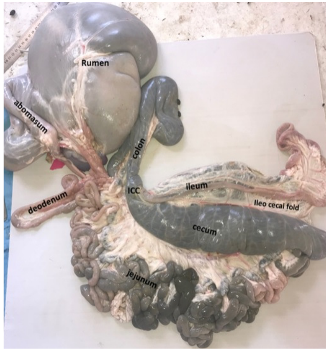
Fig. 1: The small intestine in adult local sheep appeared pale pink to gray in color composed of three segments: deodenum, jejunum and ileum.