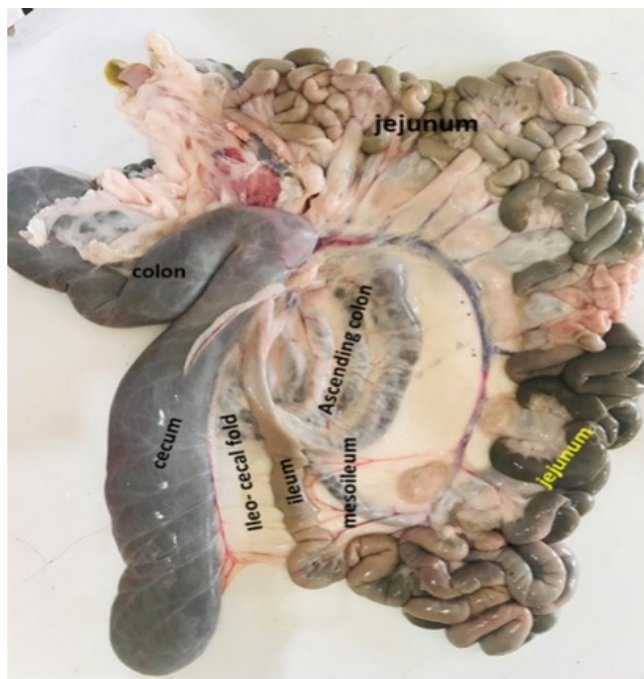
Fig. 2: Gross section in small intestine of adult local sheep. Jejunum the middle and longest part. Ileum the terminal portion which attached to cecum.