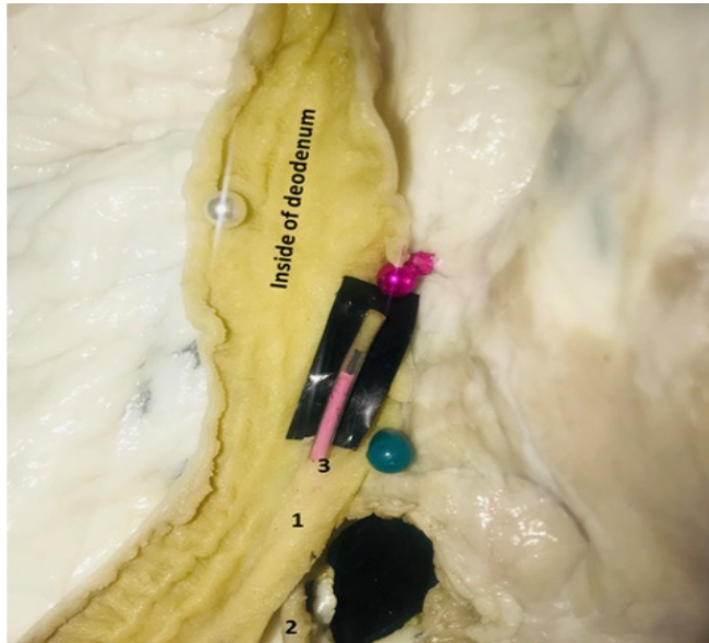
Fig. 6: Papillae of common bile and pancreatic duct inside the deodenum. 1: intramural part 2: entrance of duct 3: papillae of duct.