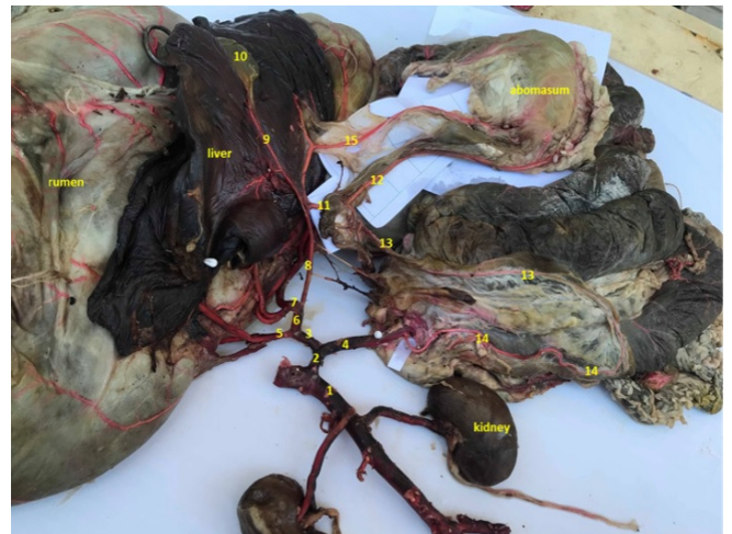
Fig. 8: Blood supply branching of small intestine. 1: abdominal aorta 2: celiaco – mesenteric trunk 3: celiac trunk 4: cranial mesenteric artery 5: splenic artery 6: hepato-gastric trunk 7: left gastric artery 8: hepatic artery 9: cystic artery 10: gall bladder 11: gastro- duodenal trunk 12: right gastric epiploic artery 13:cranial pancreaticoduodenal artery 14: caudal pancreatico_ duodenal artery 15:right gastric artery