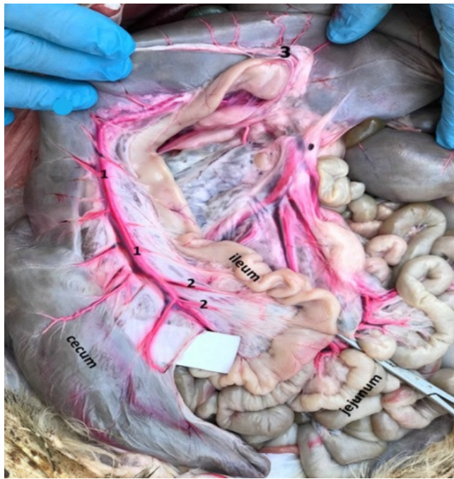
Fig. 11: Cecal artery and its branches to supplying the ileum. 1: cecal artery 2: ileal arteries or (branches) 3: ileocecolic orifice.