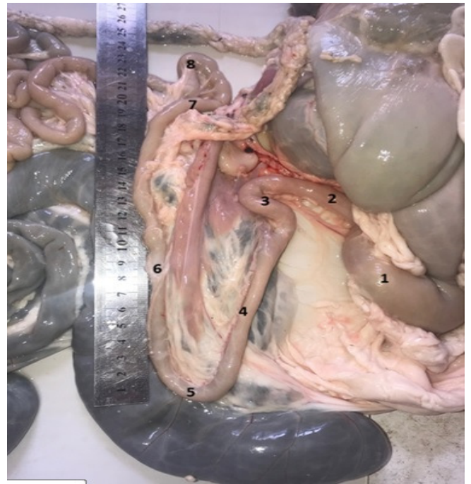
Fig. 3: Course of deodenum with its parts.1: abomasum2: Cranial portion3: Cranial duodenal flexure 4: Descending portion.5: Caudal duodenal flexure 6: Ascending duodenum 7: Deodenojejunal flexure. 8: jejunum