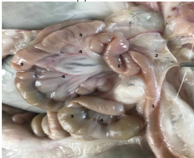
Fig. 7: Mesojejunum which appeared longer than mesodeodenum in order to give jejunum exceptional level of mobility. 1: deodenum 2: mesodeodenum 3: jejunum 4. mesojejunum