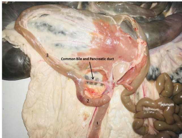
Fig. 5: Common bile and pancreatic duct which opened in deodenum at the cranial duodenal flexure. 1: deodenum 2: cranialduodenal flexure 3: Descending portion of deodenum.