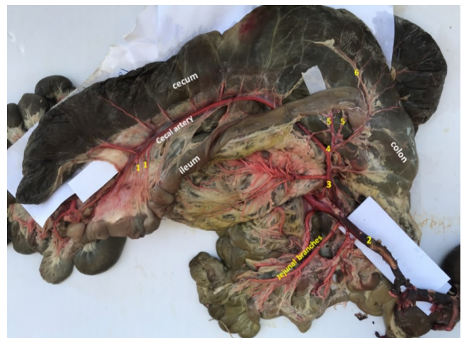
Fig. 10: Branching of cecal artery.1: ileal branches 2: cranial mesenteric artery 3: cecal artery 4: ileo colic artery5: ileal arteries 6:colic artery